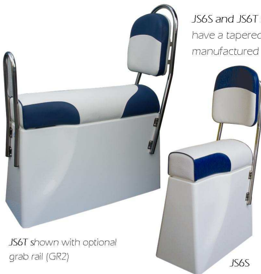
JS6T shown with optional grab rail (GR2)